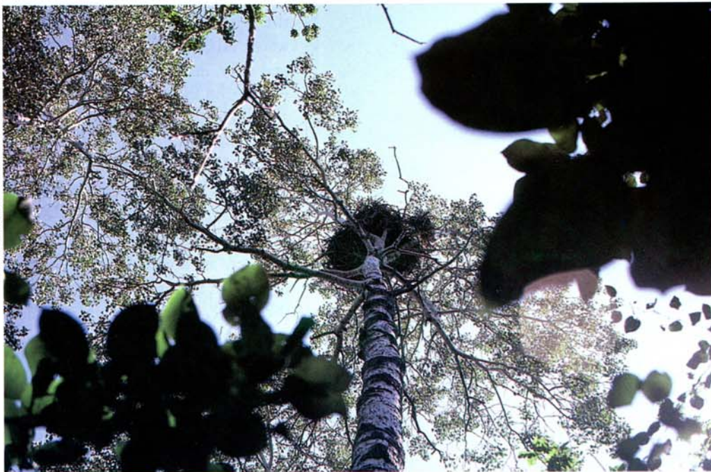
An eagle's nest (above), called an aerie, is built in a large tree and is generally six feet deep and six feet across.