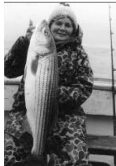
A Delaware Bay striper