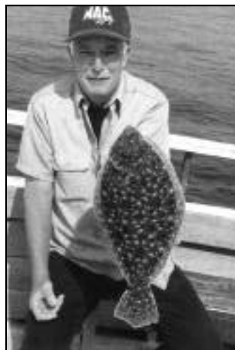
Fluke are one of New Jersey's premiere gamefish.