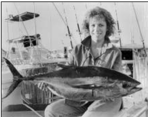
Tuna are caught in offshore, blue waters.