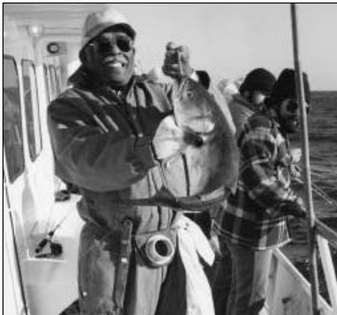
Bluefish are fighters.