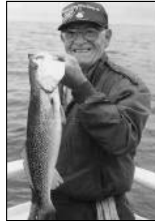
Weakfish are fall favorites.