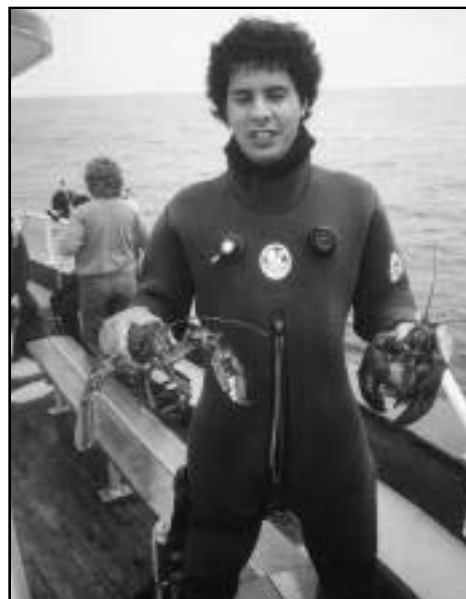
New Jersey divers catch nice lobsters.