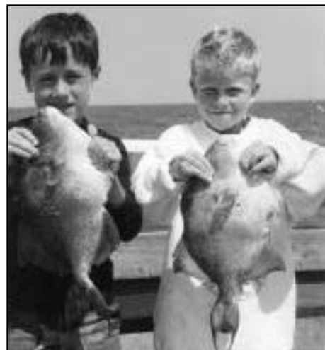
Triggerfish look strange, but taste great.