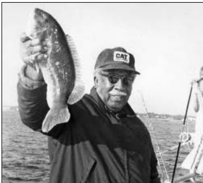
Blackfish bite best in spring and fall.