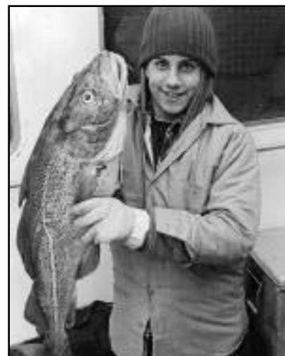
Codfish are taken in cold, deep waters.

Fluke, Weakfish, Wreck/Reef, Shark, Bluefish