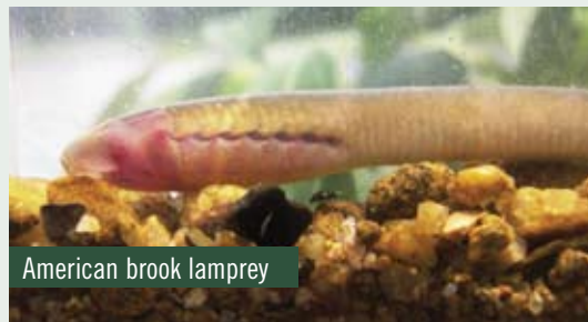
American brook lamprey

One of New Jersey's most interesting species is the American brook lamprey . They spend the first four to five years of their life blind, buried into the substrate, filter-feeding upon small particles. During the last year-and-a-half of their lives, functional eyes develop and their hood-like mouth transforms into a toothed, disk-like structure, similar to their relative the sea lamprey. However brook lampreys are not parasitic; they neither eat nor have a functioning digestive system in this adult stage, where they reach a maximum length of just over 12 inches. Because they require specific water conditions with a silt-free substrate, the American brook lamprey also serves as an indicator species, acting as a marker for this particular habitat feature.