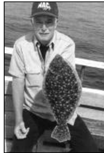
Fluke are one of New Jersey's premiere gamefish.

www.dukeofluke.com/ email: info@dukeofluke.com