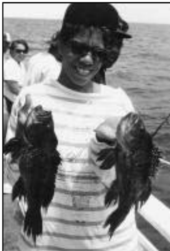
Sea bass are caught on wrecks and reefs.

January - December; Three-quarter Day, Half-Day, Full-Day Fluke, Weakfish, Striped Bass, Wreck/Reef, Shark, Bluefish, Night Bluefish Scuba Diving, Evening Cruise, Dinner Cruise, Whale Watching, Bird Watching, Weddings, Environmental Observations